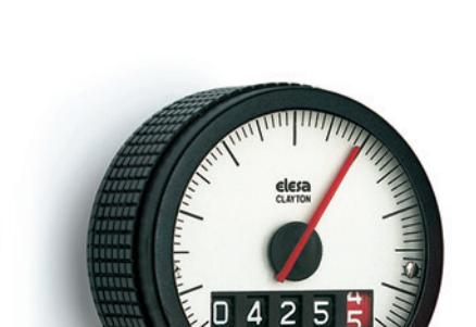
ELESA Original design